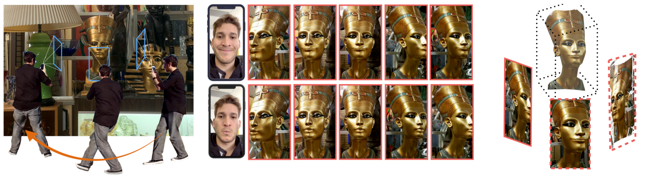
Casual Video Capture